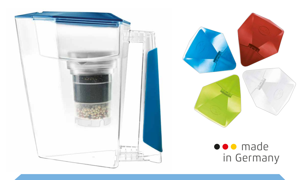
Table Water Filter System

frei von Weichmachern free of plasticizers